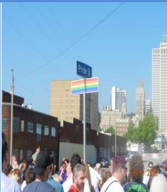
The City of Tulsa allowed the Gay community to have Pride Street.