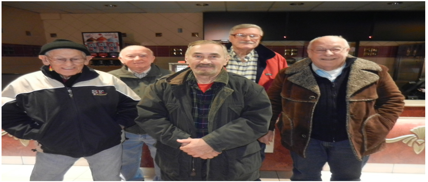
Prime Timers at the movies January 16 2018